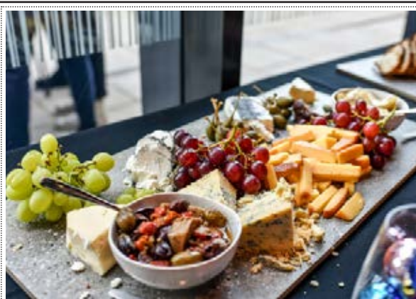
charcuterie platter (8-10pax) selection of cold cuts, cheese + condiments $350 per platter

smoked aubergine caviar cherry tomato, holy basil (v)(gf)